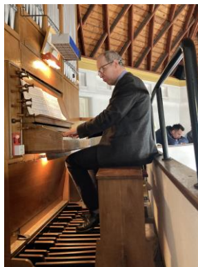
picture: last day with our old organ in April 2023